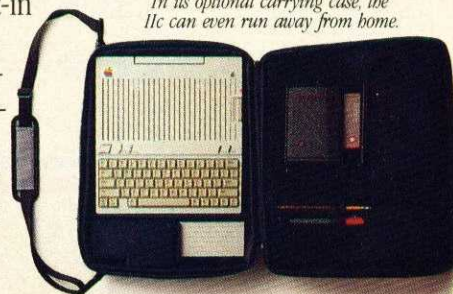
In its optional carrying case, the IIc can even run away from home.