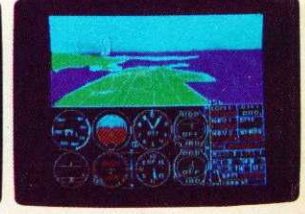
With a IIc, your kid can do something constructive after school. Like learn to write stories. Or learn to fly. Or even learn something slightly more advanced. Like multivariable calculus

preparation programs for college hopefuls. In fact, the IIc can run over 10,000 programs in all. More than a few of